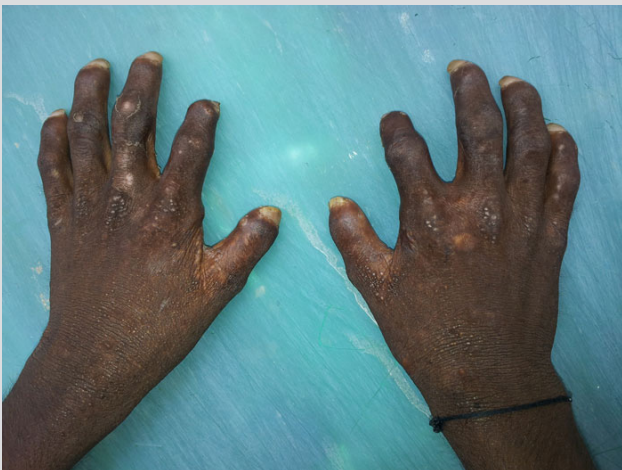
Figure 3. Vesicles, scarring of the hands, mutilating deformities of the fingers and dystrophic nails.