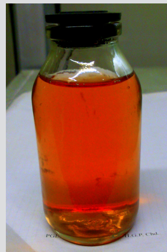
Figure 4. Urine turning reddish pink on standing