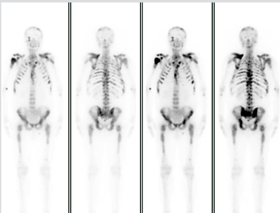
Figure 2. Bone scan confirming disseminated bone metastases, mainly in the pelvis, sacrum, and dorsal and lumbar vertebral bodies and the right humerus