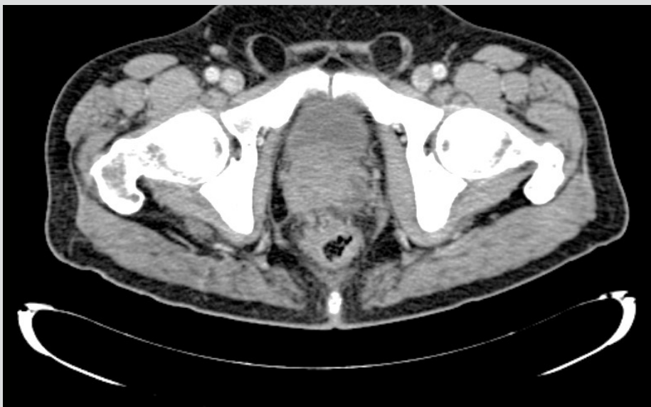
Figure 1. CT scan showing an enlarged prostate with irregular contours and heterogeneous density, which compresses the bladder

The patient had complained of cervical and low back pain for some months. A computed tomography (CT) scan was performed and revealed an enlarged prostate with irregular contours and heterogeneous density, compressing the bladder, and disseminated bone metastases, mainly in the pelvis, sacrum and dorsal and lumbar vertebral bodies and the right humerus, confirmed later by a bone scan (Figs. 1 and 2). The total prostate-specific antigen (tPSA) level was 352 ng/ml (reference value: 4 ng/ml) and a transrectal core prostate biopsy was performed. The results revealed prostate acinar adenocarcinoma Gleason 8 (4 + 4).