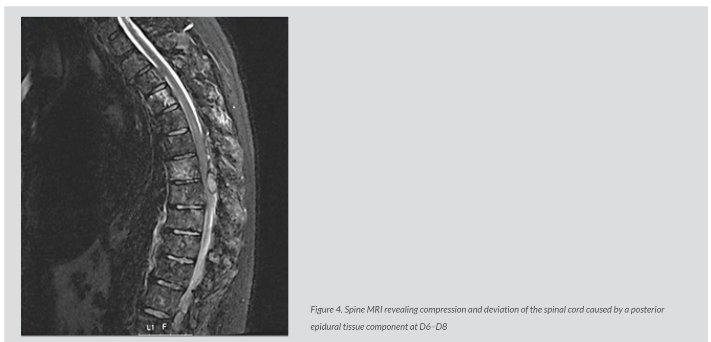
Figure 4. Spine MRI revealing compression and deviation of the spinal cord caused by a posterior epidural tissue component at D6–D8

The patient was hospitalized the following month due to spinal compression. Spine magnetic resonance imaging (MRI) showed signs of diffuse secondary infiltration in all sacral, dorsal and lumbar vertebrae, the sacroiliac wings, and the ribs. From D6 to D8, a posterior predominantly epidural tissue component, with lateral extension, was seen compressing and causing deviation of the spinal cord (Fig. 4).