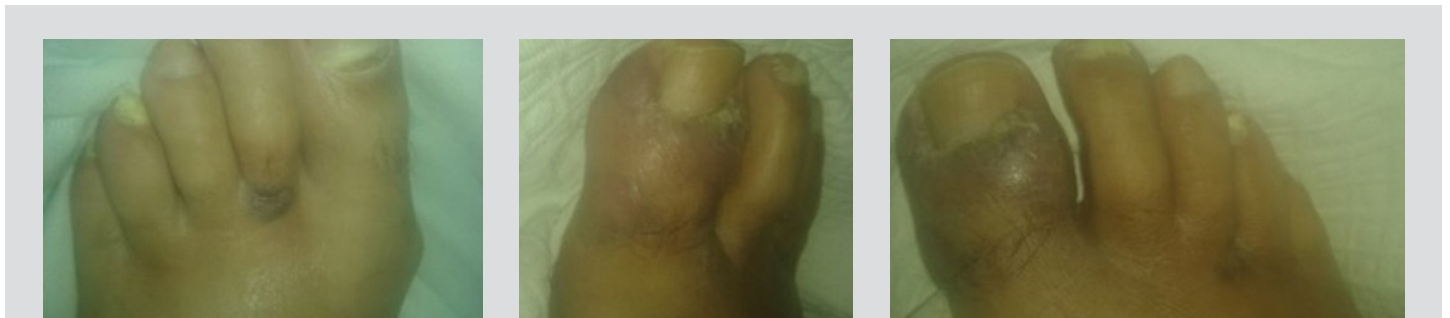
Figure 1: Kaposi sarcoma lesions.

Physical examination revealed a cachectic patient with prominent ascites and diffuse painless nodularity, with no signs of portal hypertension. His vital signs were normal. He had a soft edema in both legs, extending to the inguinal area and scrotum. A skin examination showed three well-defined violaceous non tender plaques, with 2-3 cm on both feet (Fig. 1). No mucosal lesions were found and no enlarged lymph nodes were palpable. Cardiopulmonary examination was normal.