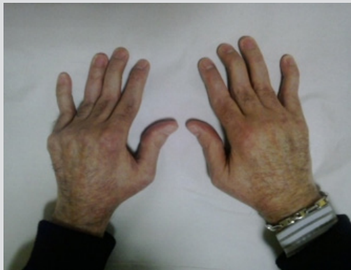
Figure 3: Morphological deformations of hands that currently presents the patient.

In the setting of a hypereosinophilic state in RA (excluding allergic, infectious and drug-related disease), case reports of tissue eosinophilia involving isolated organs are rare in the literature, but the possibility of such an association between these haematological and rheumatological entities has been discussed [9-11] .