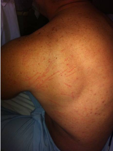
Figure 1: Erythematous maculopapular rash on the trunk and extremities (evanescent rash) worsened by scratching (Koebner phenomenon).

No other remarkable findings on physical examination were found. Laboratory tests revealed normocytic and normochromic anaemia, leukocytosis with neutrophilia, mild hypertransaminasemia and a remarkable acute-phase reactant elevation (PCR 30.8 mg/dl, procalcitonin 2.08 µg/l). Urine investigation and chest radiography conducted in the ED did not show any pathological findings.