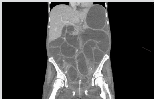
Figure 3: CT scan of the abdomen showing massive small intestine ileus.

During her second hospitalization in the gynaecology department and several days after she had undergone a laparoscopic procedure for the uterine leiomyoma, the patient developed clinical and laboratory signs of systemic inflammatory response syndrome (SIRS). A conventional abdominal x-ray demonstrated a massive small intestine ileus and a consequent CT angiography of the abdomen and pelvis showed total occlusion of the coeliac trunk and superior mesenteric artery (Figures 3 and 4). A diagnostic laparotomy confirmed the diagnosis of advanced bowel necrosis following acute mesenteric infarction and the patient died several hours later from severe sepsis.