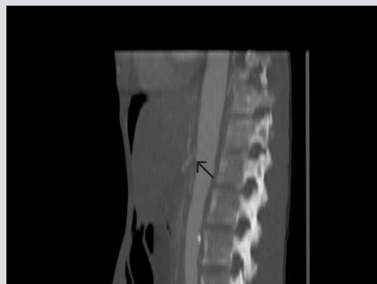
Figure 4: Abdominal CT angiography demonstrating total occlusion of the coeliac trunk and superior mesenteric artery directly after they arise from the aorta.