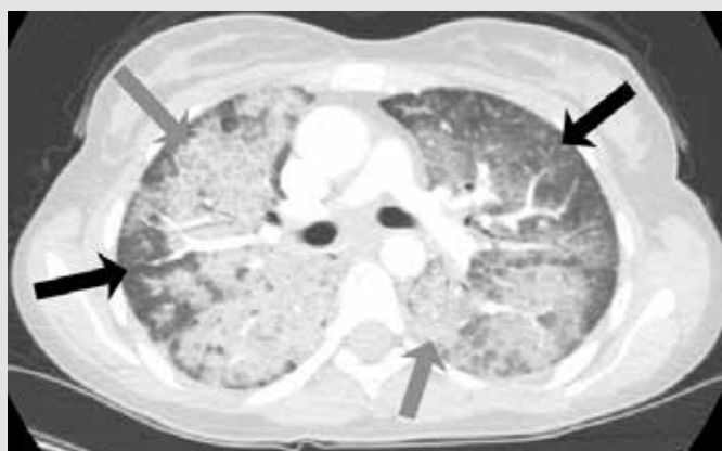
Figure 2: Axial CT scan shows dense air-space disease, with relative sparing of the sub-pleural rim of the lung peripherally (black arrows), and a superimposed interstitial pattern of thickened secondary lobular septa. The typical consolidation of alveolar proteinosis is best seen within the right lung with a 'crazy-paving' appearance (grey arrows).