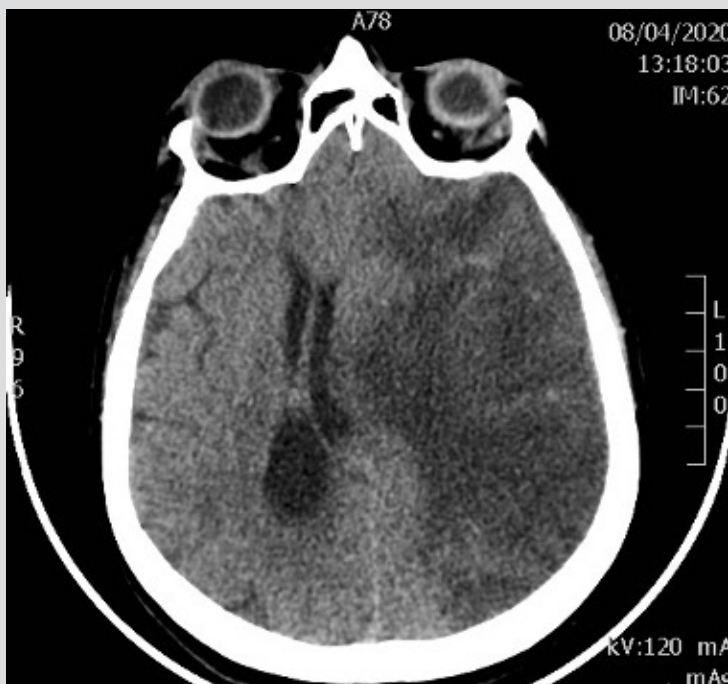
Figure 2. CT scan of the brain showing a large infarct with hypodensity in the territory of the middle cerebral artery in addition to oedema and midline shift

Unfortunately, the patient developed hypoxic respiratory failure necessitating a transfer to the intensive care department where she was intubated on the 3rd hospital day. She was mechanically ventilated and sedated with midazolam, piritramide and dexmedetomidine without the need for neuromuscular blockade. The maximal fraction of inhaled oxygen ( \text{FiO}_2 ) was 60% with a partial arterial pressure of oxygen ( \text{PaO}_2 ) of 57 mmHg leading to a \text{PaO}_2/\text{FiO}_2 ratio of 95 mmHg, consistent with the diagnosis of severe ARDS. On day 7, the dose of enoxaparin was increased to 40 mg twice a day (0.5 mg/kg twice a day) based on new insights into hypercoagulability in COVID-19 patients. On the 10th hospital day, the patient developed hypertension, which was treated with intravenous nicardipine. Because of decreasing oxygen demands, the weaning process was started on the 13th hospital day and she was finally extubated on day 16. She remained unconscious although she was breathing without assistance. At that moment a mild endorotation of the arms was documented. A computed tomography (CT) scan was performed showing a large infarct with hypodensity in the territory of the middle cerebral artery in addition to oedema and deviation of the midline (Fig. 2). At the transition of the left internal carotid artery to the origin of the middle cerebral artery, a hyperdense artery sign was seen due to a thrombotic occlusion (Fig. 3).