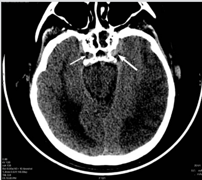
Figure 3. CT scan showing a hyperdense artery sign in the sellar region (large arrow) at the transition of the left internal carotid artery to the origin of the middle cerebral artery compared with patent vessels on the right (small arrow)

The platelet count and prothrombin time were normal. D-dimers (3941 ng/ml, normal value 0–500 ng/ml) and fibrinogen (606 mg/dl, normal value 170–420 mg/dl) were both elevated. No episodes of atrial fibrillation were documented during hospitalization. A transthoracic echocardiography showed normal left ventricular function and did not reveal a cardiac source of the thrombus. There was no evidence for venous thrombosis and although a transesophageal echocardiography was not performed, a paradoxical embolism was deemed unlikely. A decision to implement palliative treatment was taken and the patient died the same day. Additional laboratory testing revealed no antiphospholipid syndrome and no thrombophilia.