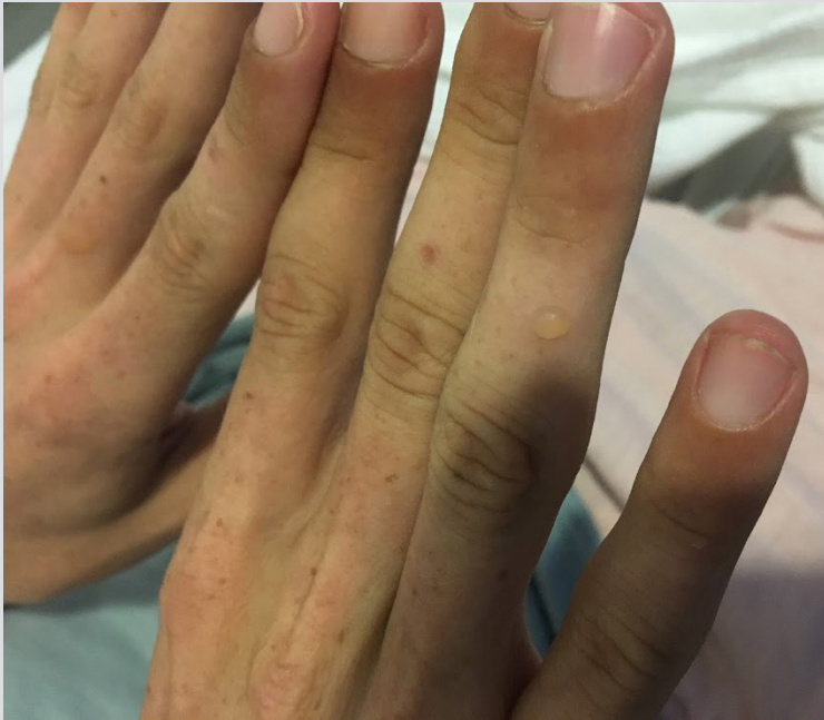
Figure 1. Photo showing a tense blister on the right ring finger of the patient

The eruption was pruritic, associated with a burning sensation, and symptoms were photoaggravated. A cutaneous porphyria was suspected; however, the results from a sample taken for free and zinc erythrocyte porphyrins were within reference intervals.