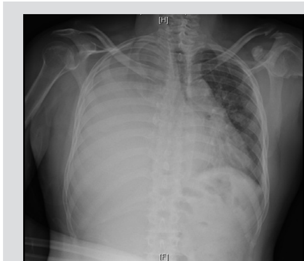
Figure 1. A chest radiograph showing a large right-sided pleural effusion

Chest computerized tomography (CT) confirmed the large right-sided PE and revealed multiple bilateral hilar and mediastinal adenopathies. Pleural biopsy identified the presence of non-caseating epithelioid granulomatosis compatible with pleural sarcoidosis (Fig. 2).