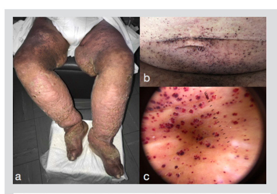
Figure 1. Symmetrical massive lymphoedema, with thickened nodular skin and brownish pigmentation. (a) On the abdomen, multiple angiokeratomas (b) can be seen, which under dermatoscopy show red lacunae (c)

Histopathological examination revealed angiokeratomas underlying superficial (upper dermis) vascular ectasia ( Fig. 2a ) and epidermal hyperplasia (acanthosis and/or hyperkeratosis) ( Fig. 2b ). Echocardiography (moderate cardiomegaly), chest x-ray, EKG and urine tests (with urine sediment) showed results within normal ranges. The patient is blood group A. His intelligence quotient (IQ) is slightly lower than normal, with normal verbal IQ but slightly reduced performance.