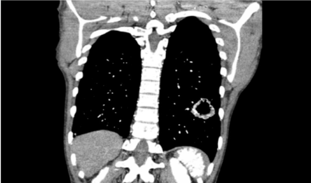
Figure 1. CT of the chest and abdomen. A 4.6 cm thick-walled cavitory lesion was located in the left lower lobe of the lung with multiple wedged-shaped splenic infarctions.

walled cavitory lesion in the left lower lobe of the lung that had grown to 4.6 cm and multiple splenic infarctions (Fig. 1). A transesophageal echocardiogram (TEE) performed on admission did not indicate any valvular lesions (Fig. 2A). Neither the set of blood cultures drawn before antimicrobial therapy nor the seven sets drawn later indicated any growth. Subsequent magnetic resonance imaging of the head performed on admission day 2 also confirmed new bilateral acute infarctions in the frontal, parietal and occipital lobes.