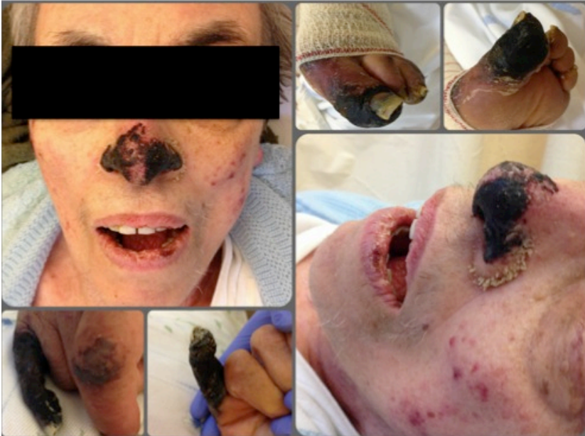
Figure 1: Complete mummification of the fifth finger of both hands, both first toes and gangrenated tip of the nose.

On arrival, she was stuporous, shivering, moaning and not responsive to interrogation. She was severely dehydrated, pale, cachectic, but otherwise haemodynamically stable, and had no tachypnoea, fever or lymphadenopathy. Cardiopulmonary auscultation: arrhythmia (HR around 80); basal bilateral fine crackles. Nonexudative gangrene (mummification) was observed on all four distal limbs and the nasal pyramid ( Fig. 1 ).